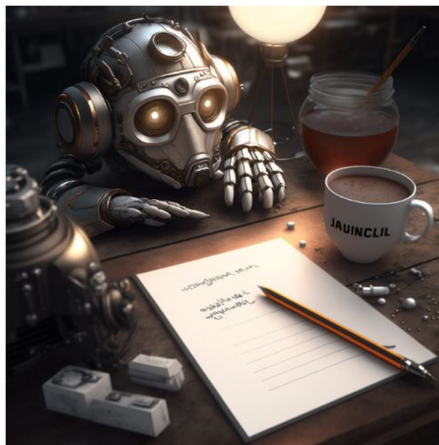
Figure 1. Artificial Intelligence assisting the writing process, as imagined by the Midjourney text-to-image generator.

This well-structured answer makes reasonable points on both the potential and limitations of its author. As we write, the “assisted-driving” approach suggested by ChatGPT (AI-